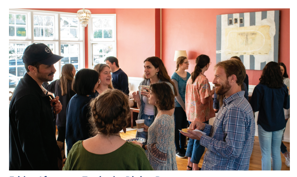
Friday Afternoon Tea in the Dining Room